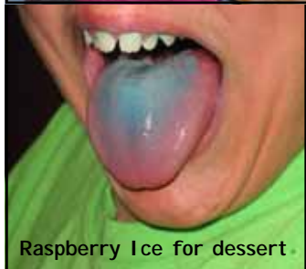
Raspberry Ice for dessert