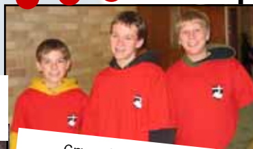
Crusader Tee Shirts!